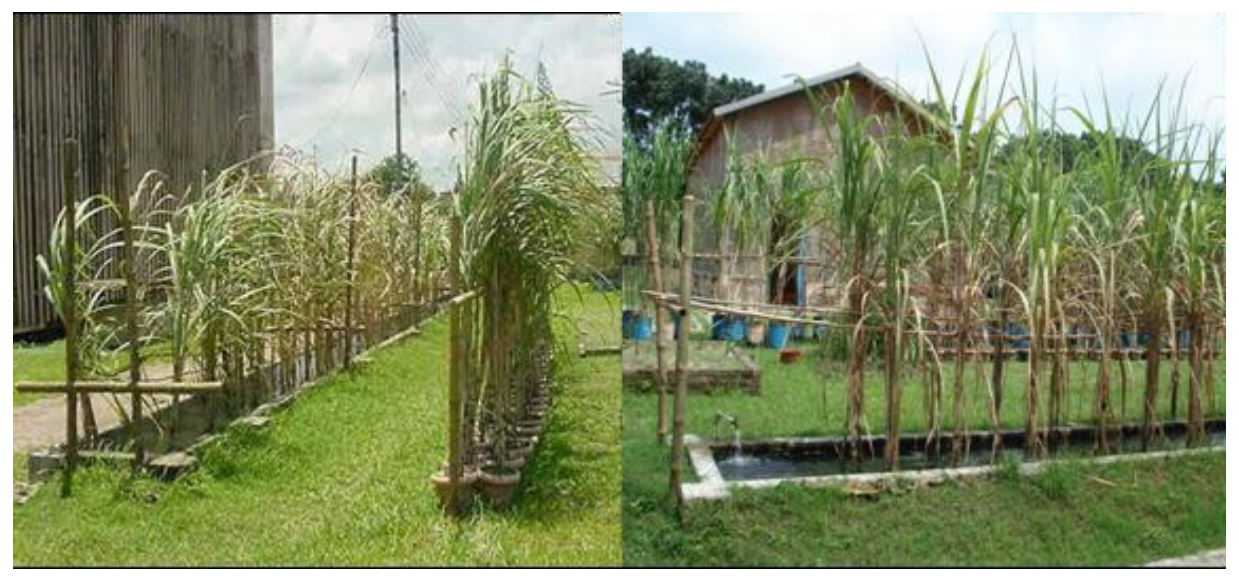
Fig. 1: Screening for waterlogging tolerance conducted in a concrete water tank under induced flood stress condition with control.

normal and waterlogged conditions and reported reduction in plant height (7.22%) and stalk diameter (16.38%), but considerable improvement was observed in number of nodes (14.8%), internodal length (17.65%), nodes carrying roots (42.86%), number of roots (62.72%) and root volume (49.29%) conferring tolerance to waterlogging stress. While marginal increase of 7.69%, 5.76% and 8.53%, observed in leaf area index, leaf production and specific leaf weight respectively. Long term flooding reduced primary root length, leaf weight and yield of sucrose among susceptible sugarcane clones<sup>29,88</sup>.